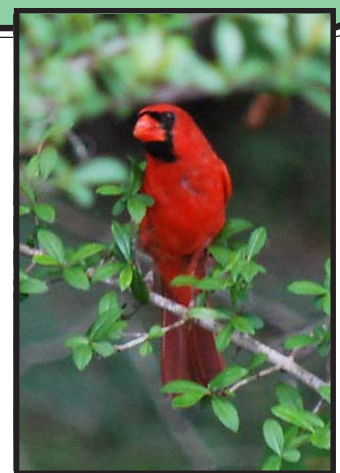
Male cardinal