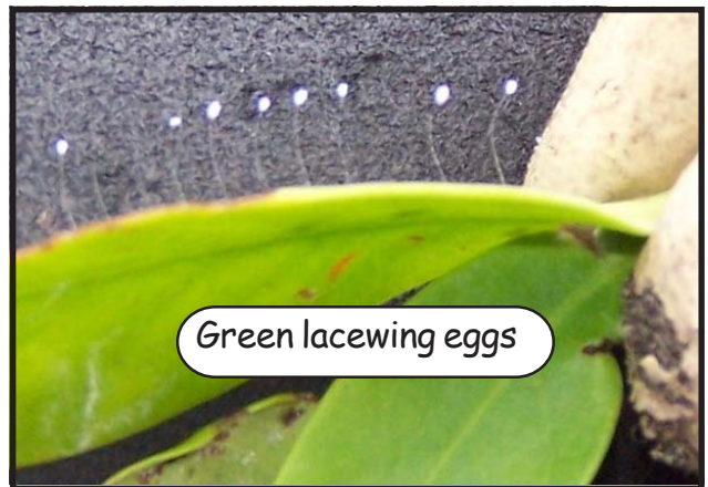
Green lacewing eggs

Our last workday in the Wildflower Garden was on December 8 and there were three of us (Laurie Angyn, Bill Brown and Pam Brown) planting some leftover plants from the plant sale at the Wildflower Festival and deadheading the spent wildflowers. There was one lonely blanketflower still open and a lyre-leaved sage blooming out of season. We collected some seed from the blazing star, rosinweed and narrow-leaf sunflower to sell in the gift shop. A Florida anise was added to the native shrub demonstration area - much thanks to Bill for helping to get the plant to the Preserve and planting it. I noticed a leaf on the anise that contained green lacewing eggs. Lacewings are beneficial insects and the eggs look like little hat pins on the leaf (see picture). Mark your calendars for our next workday on January 26, 2013 from 9 to 11 a.m. This will be the inaugural meeting of the Wildflower Garden Club - come join us. Remember to bring gloves and tools. We will provide the snacks.