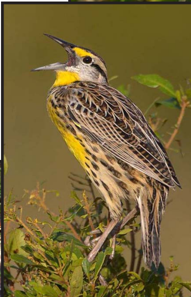
Pine lily Meadowlark

ours to explore. It takes nearly two Brooker Creek Preserves to provide enough space for one Florida black bear and nearly 50 of them to provide space for a population that might remain stable over time. For Florida panthers, it might take twice as much. We will never have enough space for these mega-species, but we have room for nearly everything else that once roamed this region or comprised its habitat.