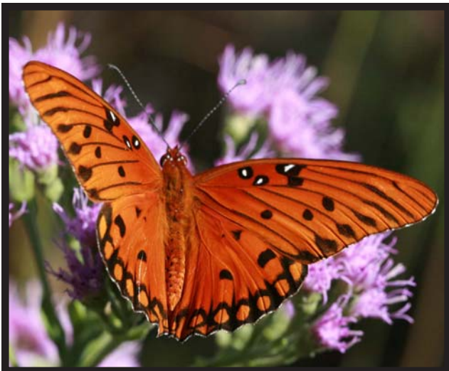
Left, gulf fritillary on a Florida paintbrush ( Carphephorus corymbosus )

The native blue passionvine requires well-drained sandy soils to persist as well as plenty of sunshine. Do not attempt to use it in landscapes that are too shady or where soils remain too moist. When conditions are to its liking, however, it spreads rapidly and suckers extensively. Individual shoots may reach more than 10 feet long and each is equipped with tendrils that allow it to grasp adjacent vegetation and climb. Its aggressive growth form is necessary because it is often eaten as fast as it grows by the caterpillars of several butterflies - especially those of the Gulf fritillary. In most locations, it is a constant battle between caterpillar and vine. Sometimes the caterpillars eat everything above ground, but then the plant resurfaces a few feet away and starts over.