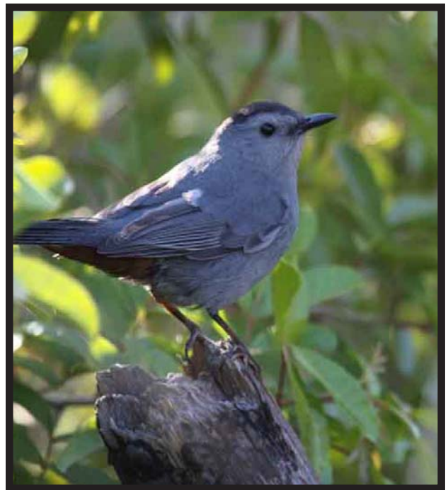
catbird