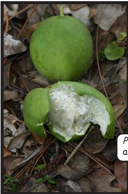
Passiflora incarnata and ripe fruit

garden centers are not native and some of these are not good for butterflies.