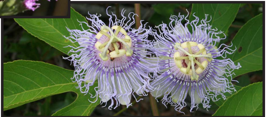
Blue passionvine ( Passiflora incarnata )